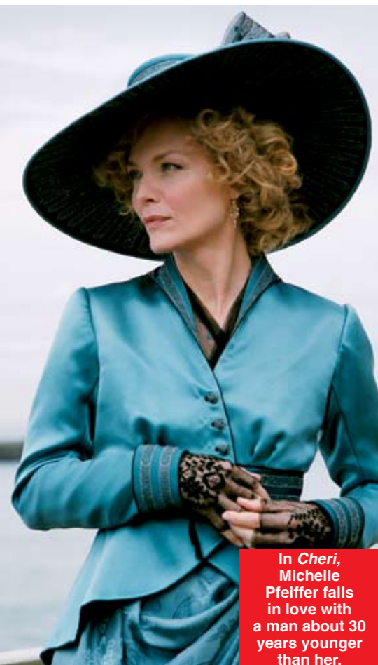
In Cheri , Michelle Pfeiffer falls in love with a man about 30 years younger than her.

Michelle Pfeiffer's latest movie Cheri , a lavish costume drama based on the novel by French writer Colette, is on circuit this month.