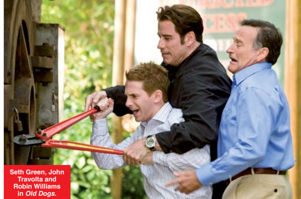
Seth Green, John Travolta and Robin Williams in Old Dogs .

John Travolta, 55, earned iconic status for his roles in Saturday Night Fever , Grease and Pulp Fiction , and he's back on screen this month in Old Dogs . He's famous for his career fluctuations, but nothing could have prepared him for the tragedy that he and his family suffered this year.