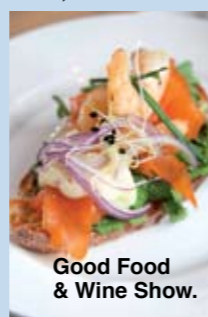
Good Food & Wine Show.

◆ The Christmas Concert at La Motte Estate in Franschoek will be held on 28 November. For details and to book, call 021 876 4540.