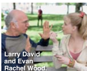
Larry David and Evan Rachel Wood.

WHATEVER WORKS Inspired by Woody Allen directing Larry David is a marriage made in heaven (or hell, depending on your comic or moral persuasions). Set in New York, it tells the story of suicide attempter Boris Yellnikoff (Larry David), who is charmed into marriage by a barely legal runaway beauty queen played by Evan Rachel Wood. The wheels come off when the new wife's mother (the fabulous Patricia Clarkson) steps in to 'save' her daughter.